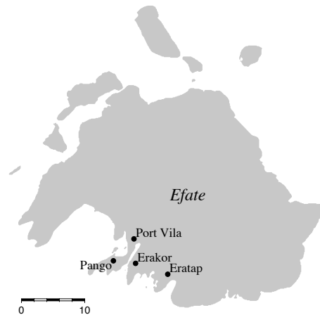
Figure 1: A map of the island of Efate showing the locations where Nafsan is spoken

only obligatory marking of the verb (Thieberger, 2006:149). They attach to any following word: a TMA marker, an auxiliary verb, a benefactive phrase, or the verb (Thieberger, 2006). Each marker occupies a specific morphosyntactic position and its position in the verbal complex is fixed relative to the other elements. Table 1 shows the ordering of these elements in the Nafsan predicate. Each category is exemplified with a given functional word in the second row.